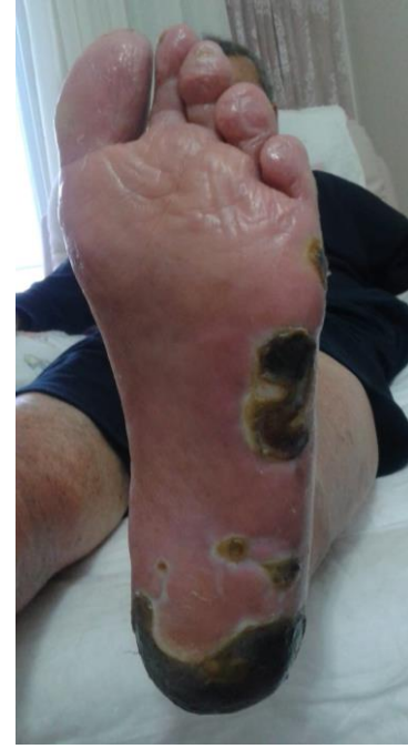
Figure 2. Treatment Before